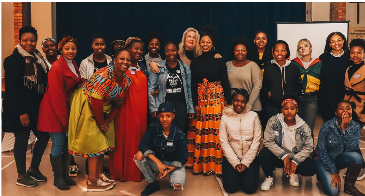
Dreaming Girls Music Conference female participants pictured above.

that “western culture and knowledge has taken centre stage, and it is evident in the art and music that is celebrated today. It is time that we knew about our culture and embraced it”.