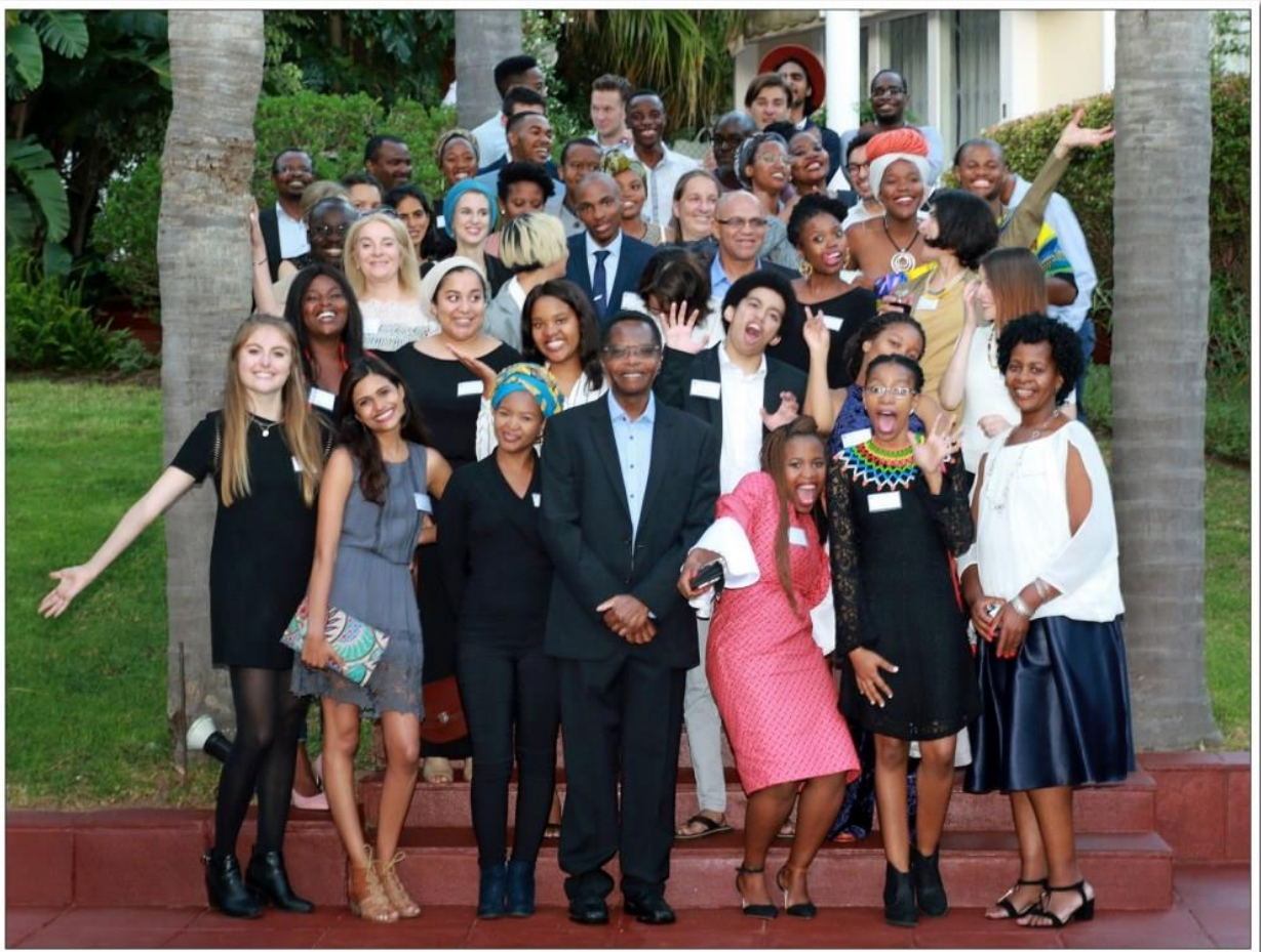
Above Image: A light moment at the Welcome Drinks Reception at Prof Zingoni's residence on 21 February 2018. Welcoming new and past KJB scholars.