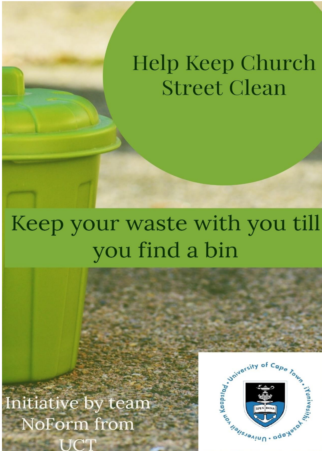
Figure 10: Poster for littering